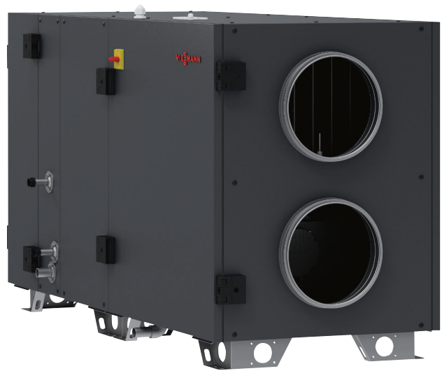
Vitoair CS PRO – suitable for indoor and outdoor installation

Vitoair PRO from Viessmann is a new, high performance ventilation solution that is equally well-suited to offices, children's nurseries, shops, meeting places and apartment buildings.