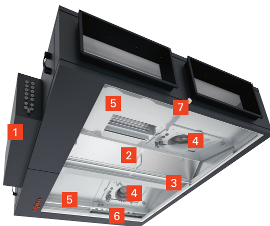
Vitoair FS PRO