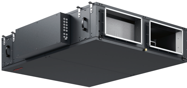
Vitoair FS PRO – particularly low height for installation in suspended ceilings, cavity floors or for pre-wall installation